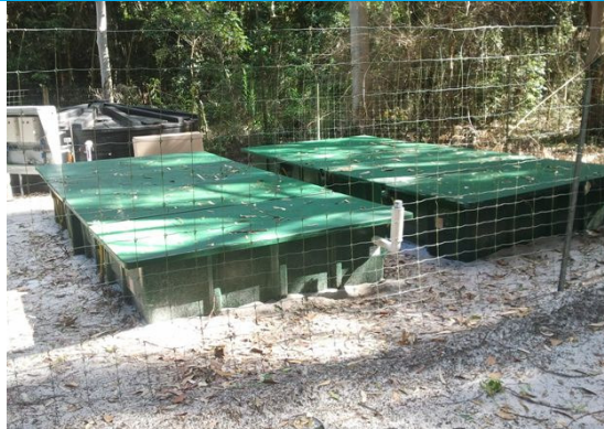
Central Station Campground, Fraser Island, QLD

Innoflow Australia has had a very positive start to 2012. With the installation success of the AdvanTex® AX200 into the Central Station Campground on Fraser Island QLD, a second AdvanTex® treatment system will be installed on the island. This plant will service the Waddy Point Campground. The system is modular, made from two AdvanTex® AX100 treatment pods, allowing for expansion if and when it's required. The equipment is in transit and will be installed in June by Alliance Water Solutions.