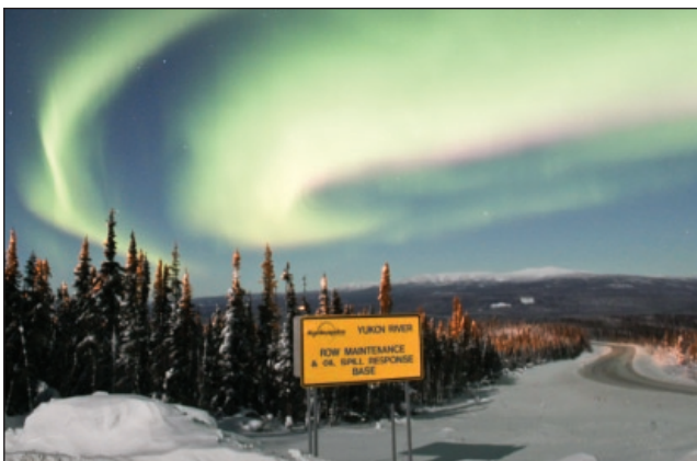
Alyeska Pump Station 6 is located on the Yukon River in Alaska, just south of the Arctic Circle.

Temperatures can range from the 90's (35° C) in the summer to -60° (-50° C) in the winter. Also, the ground is permafrost, so infrastructure has to be installed above-ground. Alyeska needed a wastewater solution that could address the site's temperature extremes and installation parameters.