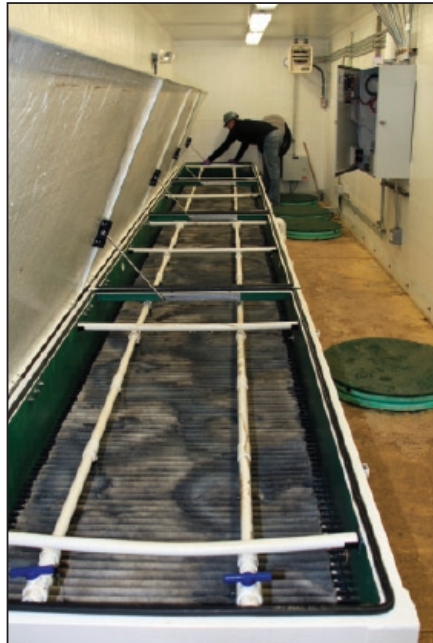
The insulated control room allows for easy maintenance regardless of weather conditions.

Alyeska’s AX-Mobile also includes an optional control room built over the treatment system. Varney continues, “It can be kind of a spooky place out there when it’s 20 below (-30° C) and dark. But that control room is always warm and toasty.” The control room offers workers a location to easily monitor operations