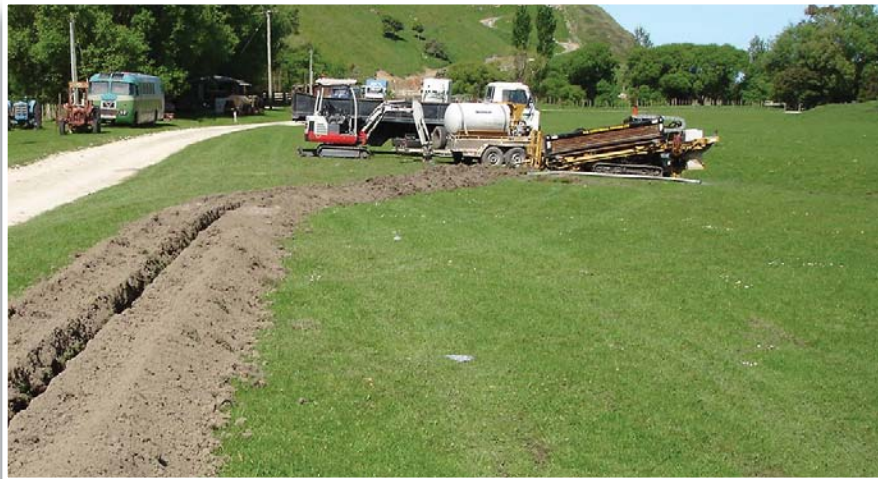
Effluent sewers allow low-impact installation with small trenches and directional drilling.