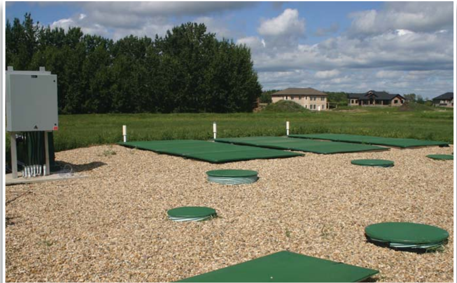
Green space was preserved at Habitat Acres in Alberta using a decentralized wastewater system.

The treatment system consists of ten AdvanTex AX100 pods, with room to add an additional five units, if the community grows. The modular system accommodates the large seasonal variation