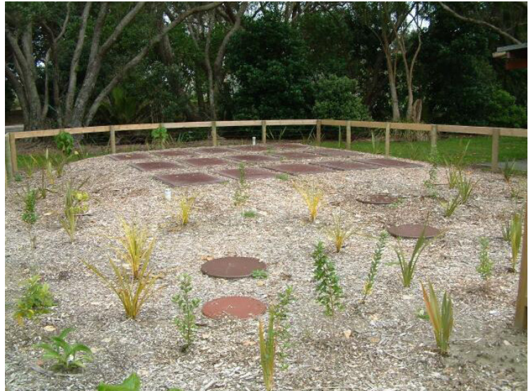
Figure 3; The AdvanTex Treatment PODs from Orenco are available in multiple sizes, providing flexibility in treatment plant siting

As with the Centrelink Project, the solution here provides a low whole-of-life cost alternative to other approaches, with a passive, low energy front end coupled with proven disinfection techniques